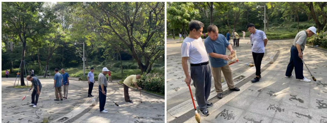
Figure 1: Chinese Calligraphy Scene of "Writing on the Ground" in Tianhe Park, Guangzhou, China

Art education has been shown to enhance social and emotional learning (SEL) by improving goal setting, enhancing empathy, building relationships, and improving decision-making (Mogro & Tredinick, 2020). Chinese calligraphy, an extremely expressive and iconic art form in China, reflects human emotions (Han et al., 2023). With its rich history, Chinese calligraphy is an integral part of China's outstanding traditional culture (Wang, 2023a). Chinese calligraphy, as a comprehensive art form, serves as a window into traditional Chinese cultural values through its unique artistic expression and language (Peng, 2023). Moreover, Chinese calligraphy holds widespread appeal in China, attracting diverse demographics, including the elderly. The phenomenon of "Write on the Ground" reflects the engagement of Chinese seniors in learning calligraphy. Many elderly people in China gather in groups of three to five at parks, equipped with specially designed large brushes to practice calligraphy on the ground using water. As shown in Figure 1, they share insights and experiences related to calligraphy and convene at a fixed time and location spontaneously. Furthermore, they derive a sense of fulfillment from their need for learning calligraphy. This study focuses on the gains experienced by elderly individuals in learning Chinese calligraphy through "Write on the Ground" and whether it has a positive impact on their well-being.